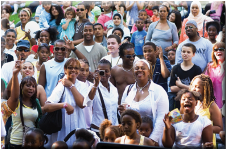
Residents at Queen's Park Festival