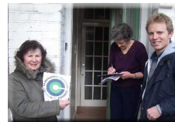
Above: Exploratory meeting number 3.

A number of exploratory meetings were held with residents to test the idea and ensure sufficient support before launching the campaign in January 2011.